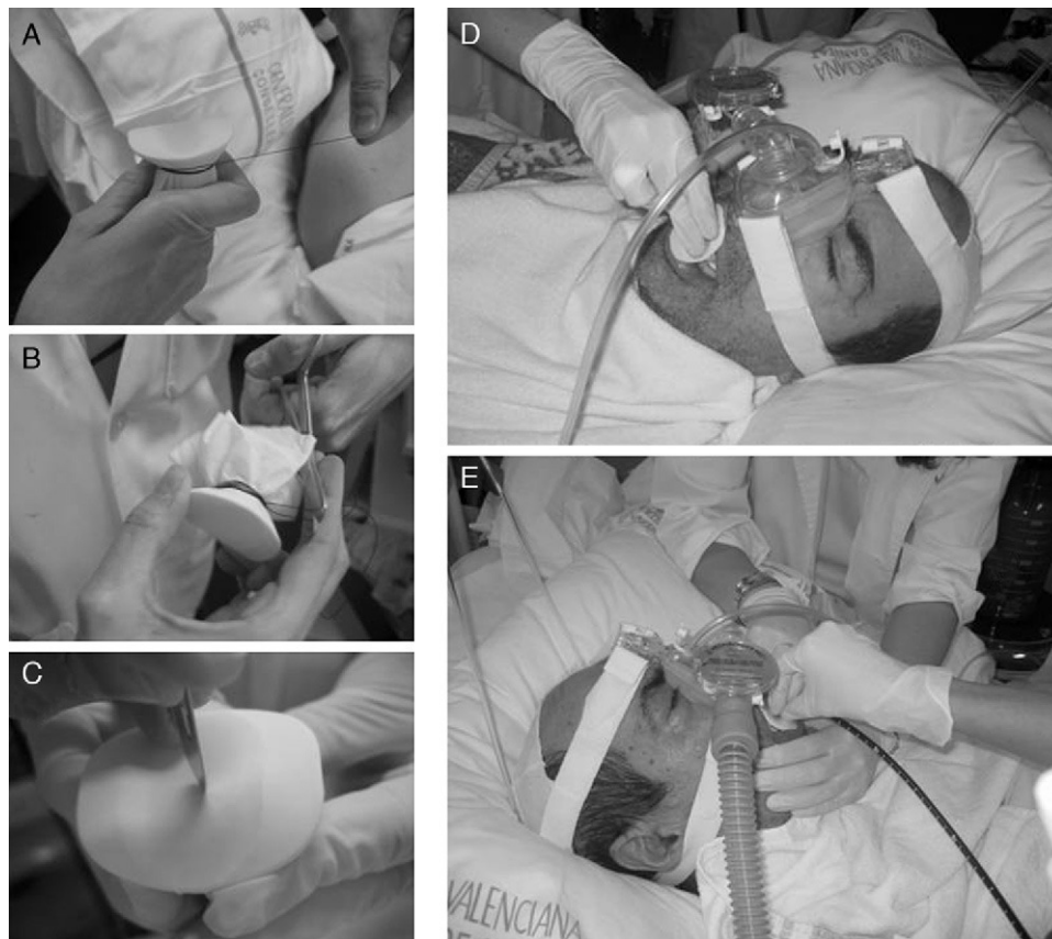
Fig. 7. Non-invasive mechanical ventilation carried out with a nasal mask and insertion of the bronchoscope through the mouth. (A) Bite block placed inside a latex glove and held with a suture. (B) Excess material is cut off. (C) Minimal incision in the membrane of the mouthpiece. (D) Introduction of the bite block under non-invasive mechanical ventilation. (E) Oral insertion of bronchoscope and technique carried out with non-invasive ventilation.

If there is hypoxemia, EPAP is increased 2 \times 2 cmH 2 O until an O 2 saturation \geq 90\% is reached. It should be kept in mind that very high values (greater than 10) can cause greater risk for gastric