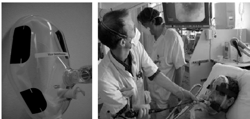
Fig. 5. Face mask for non-invasive mechanical ventilation, coupled to a fenestrated cylindrical piece for the insertion of the bronchoscope.

NIMV will be maintained with parameters similar to those prior to bronchoscopy within 15 and 90 min after the end of the procedure. 12,23,29,41