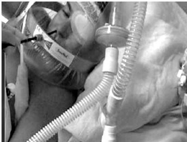
Fig. 4. Helmet-type interface for non-invasive mechanical ventilation; by insertion of the bronchoscope through a fenestrated piece, either the nasal or oral approach can be used.

Oral insertion can also be used with modifications and systems coupled to a bite block, with the concomitant use of a nasal mask. 42 In explorations with the helmet, either nasal or oral entry could be used, with the patient sitting or in supine decubitus. 35 Likewise, the use of Boussignac CPAP, since it is an open system, allows for