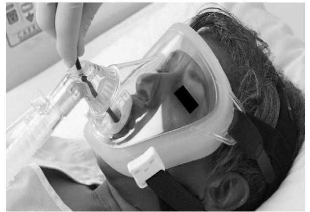
Fig. 1. Face mask for non-invasive mechanical ventilation with diaphragm for the entry of the bronchoscope; oral insertion through the mouthpiece.

Chiner et al. 37 have recently published the results of a prospective study with 35 patients that used a hand-made system of a