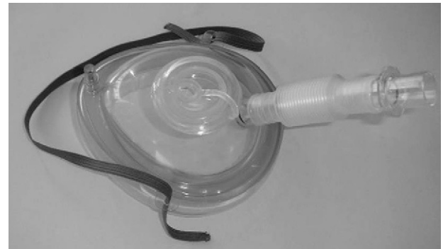
Fig. 2. Variation of an oronasal mask equipped with an insertion diaphragm, independent from the non-invasive mechanical ventilation supply channel.

membrane made out of a latex glove coupled with a bite block with a small incision. This maintains the pressure administered by BIPAP through a nasal mask, and bronchoscopy is carried out orally with good diagnostic and therapeutic results (Fig. 7).